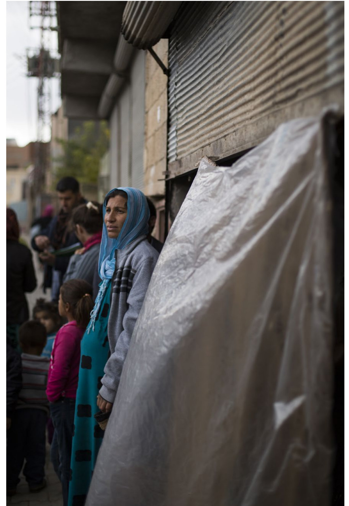
A family from Kobanî is registered in the Turkish border city of Suruc.

As the conflict developed, it became increasingly difficult for casualties of war to get access to treatment. There was less and less medical assistance available for the general population as well – for vaccinations, treatment of burns, chronic illnesses or childbirth.