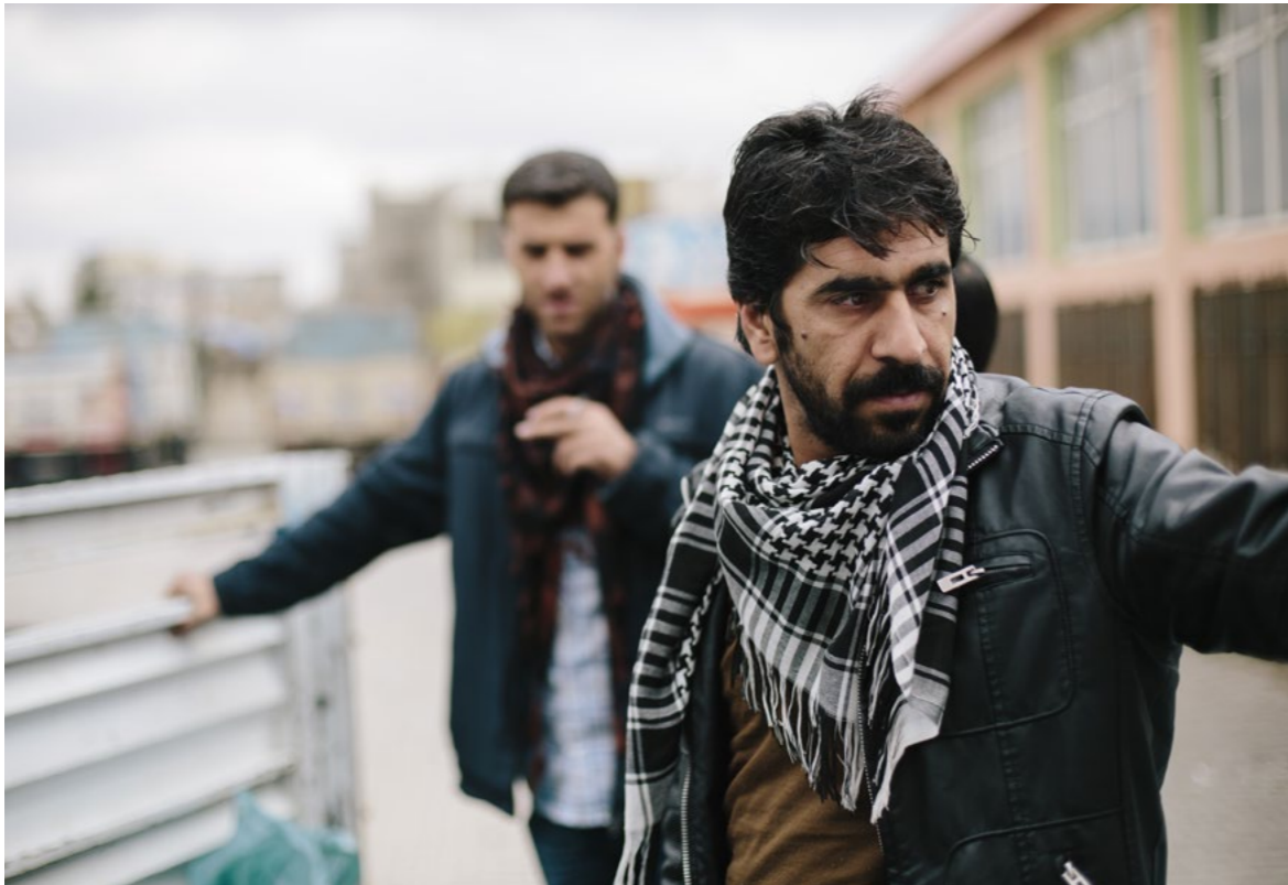
Volunteers help to unload a truck with rationed aid supplied for the refugees.