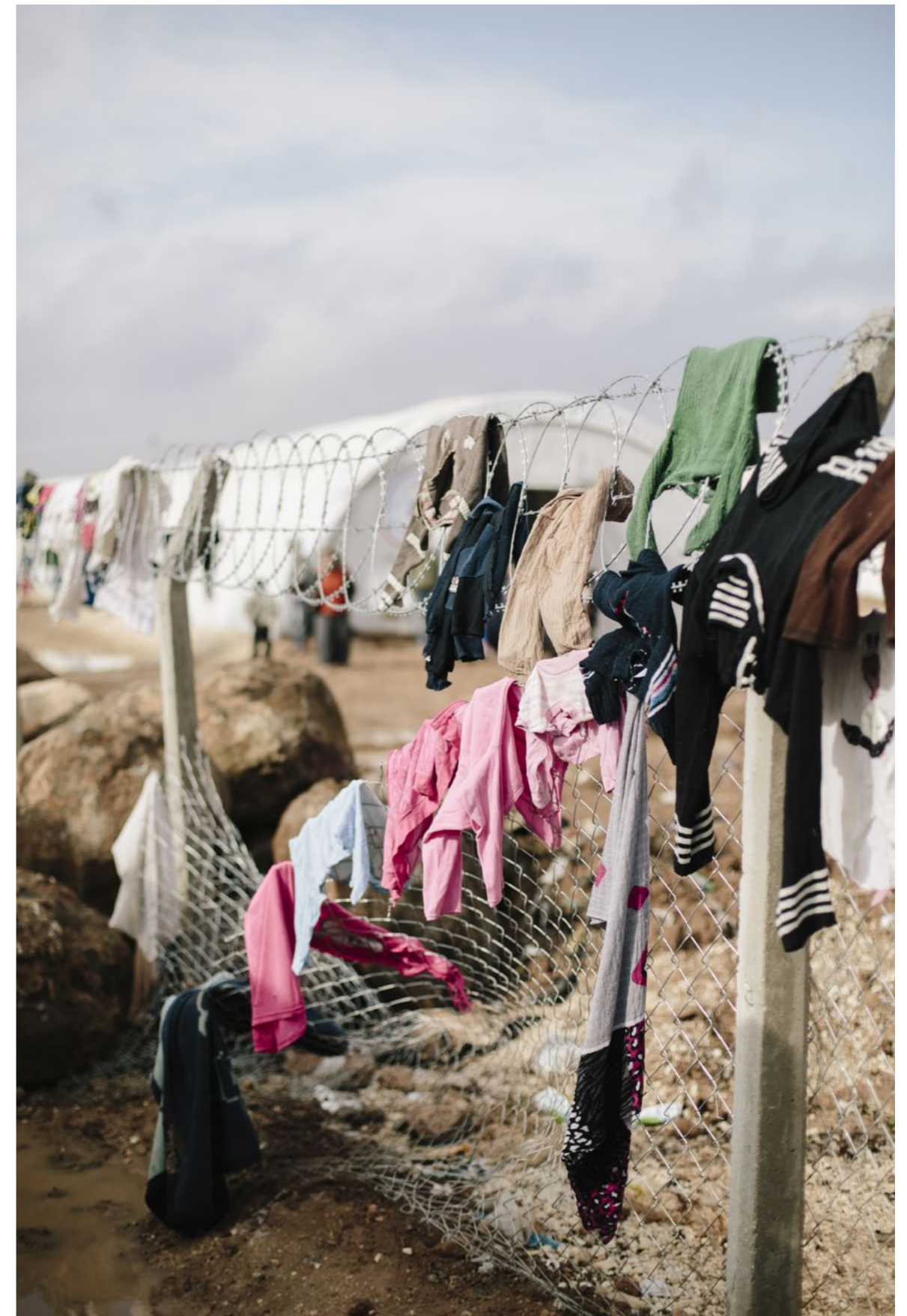
Clothes hung out to dry in a refugee camp. From: photography series "Leaving War Behind", Cédric von Niederhäusern, 2014.