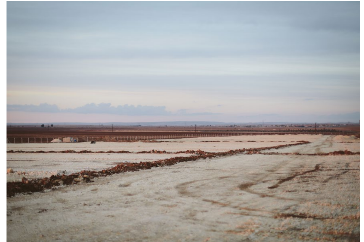
As the influx of refugees continues, additional camps are built in the local area.

Amnesty sections in Canada, USA, France, Norway, Brazil, Japan, Australia, New Zealand,