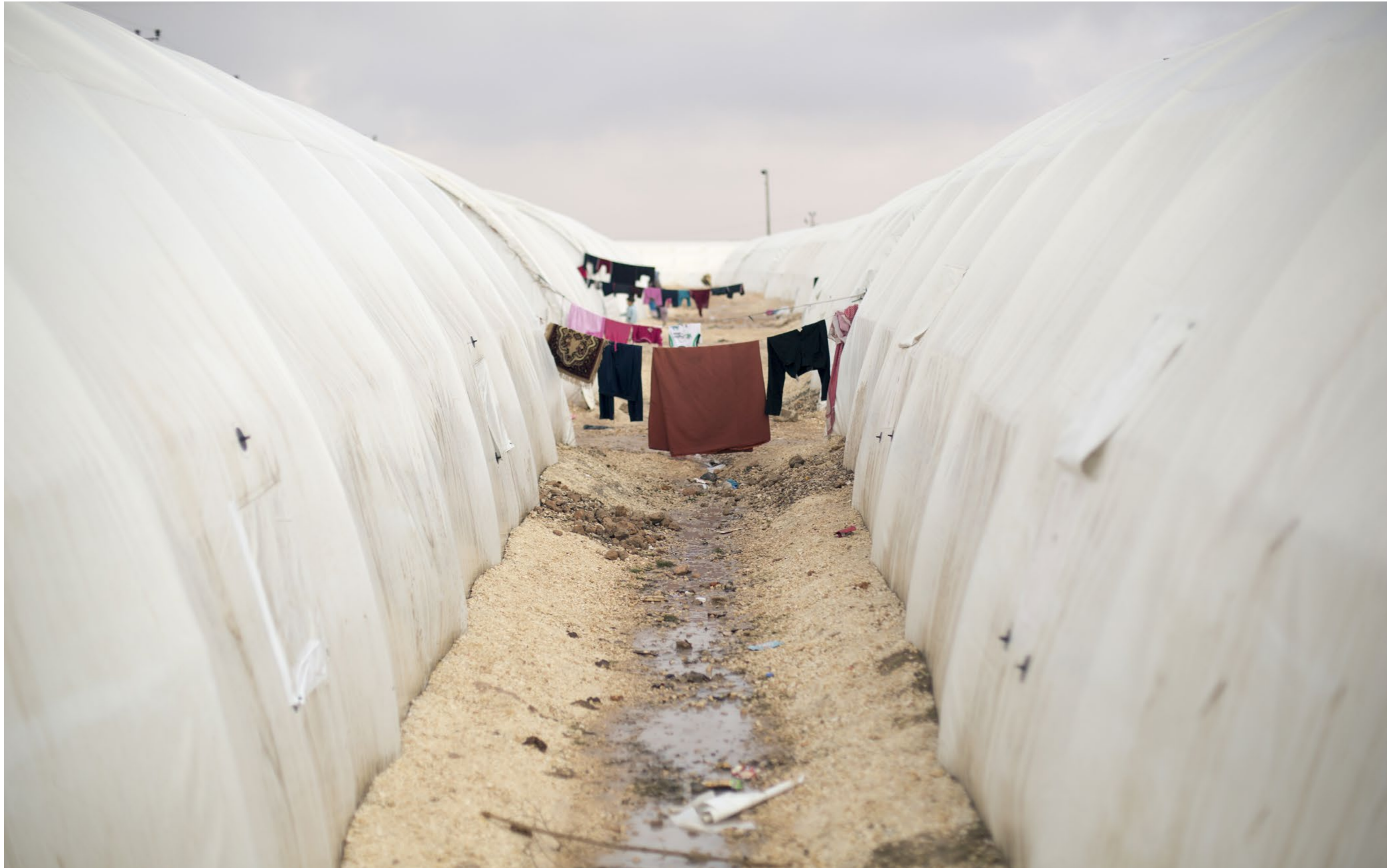
The thousands of people living in the camps try to create a semblance of ordinary life by following a daily routine.