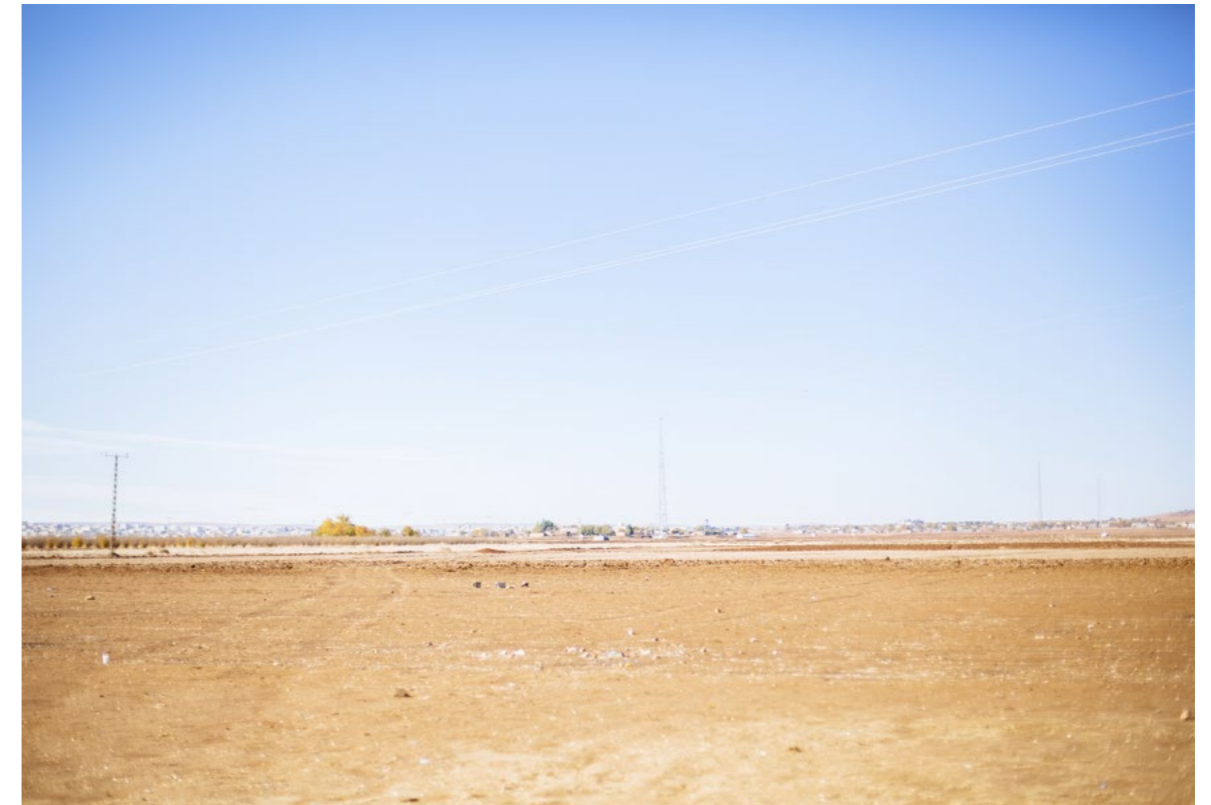
A buffer zone separates the embattled city of Kobani from Turkey. From: photography series “Leaving War Behind”, Cédric von Niederhäusern, 2014.

Since the summer of 2015 our offices are located in new, central spaces in Bern. The grant administration has been switched to a more ef-