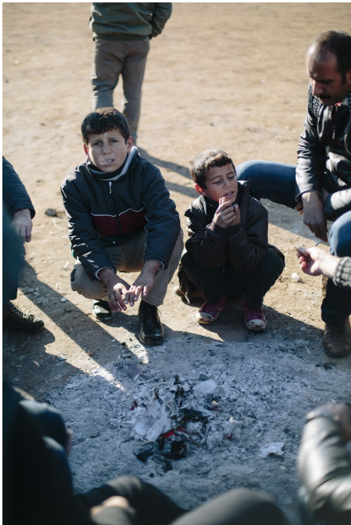
A cold November morning in the village of Mehser. Children sing while warming up by the fire. From: photography series "Leaving War Behind", Cédric von Niederhäusern, 2014.