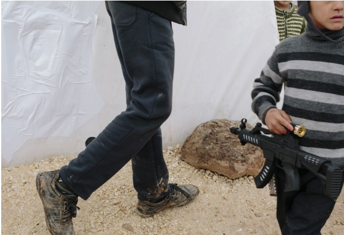
AFAD refugee camp in Suruc.