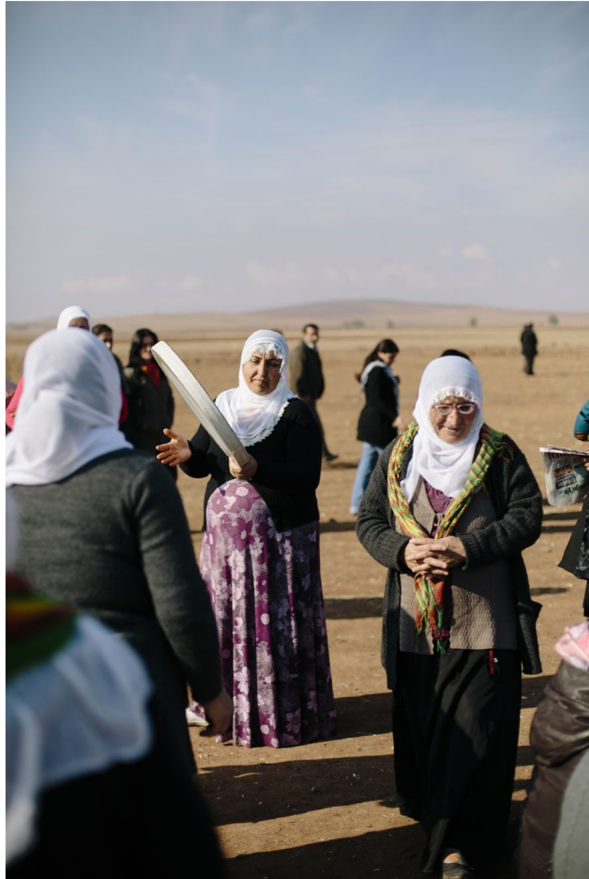
Women make music at the Turkish-Syrian border on the International Day for the Elimination of Violence Against Women.