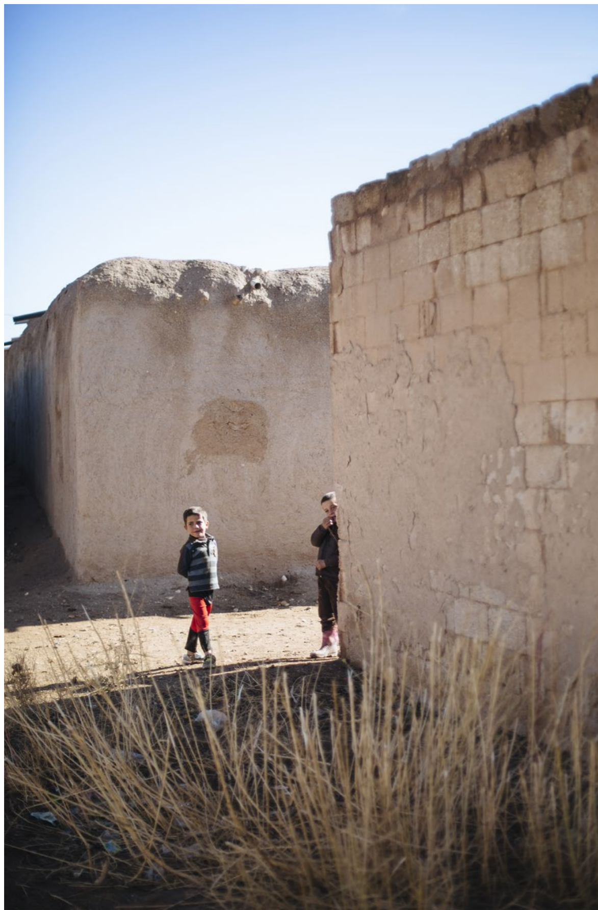
Children at play in the village of Mehser. From: photography series "Leaving War Behind", Cédric von Niederhäusern, 2014.