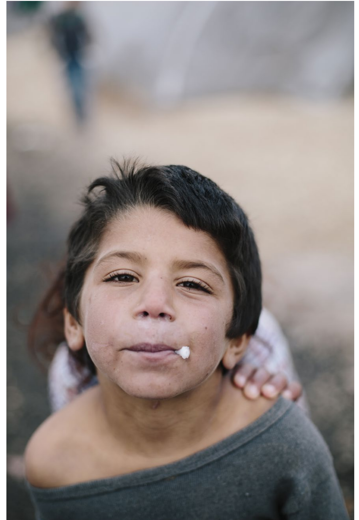
Finding things to do for the children is important in the camps.

Most of Kobani's residents have now returned to their city. Following a directive by the Turkish government citing changes in land use, however, the last remaining refugee camp in Suruc was disbanded in January 2016 – despite the fact that about 40 families continue to live there and depend on humanitarian help.